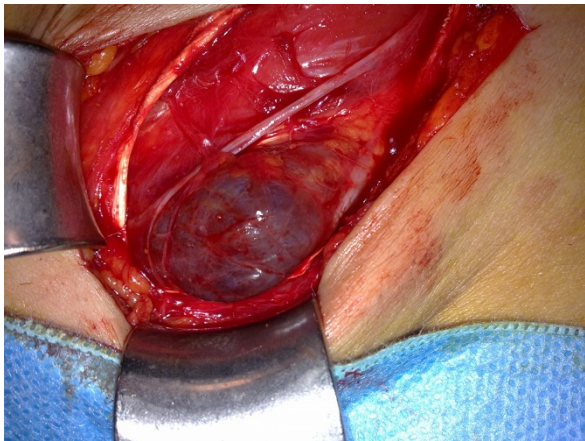
Figure 1 Inguinal image that mimics a venous aneurysm.

A venous aneurysm is usually defined as a venous dilation which communicates with a main venous structure by a channel. It may cause serious complications such as deep vein thrombosis and pulmonary emboli [4]. Venous aneurysms can be seen in every major veins and may be misdiagnosed as an inguinal hernia [5]. Femoral vein aneurysm is a rare clinical pathology [6]. It may also be misdiagnosed as an inguinal or femoral hernia. Castaldo ET, have been presented a femoral vein aneurysm simulating an inguinal hernia and added that