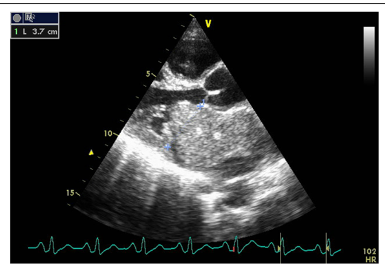
Figure 1 Transthoracic echocardiography long-axis view shows a giant left atrial myxoma fills almost the entire left atrium.

size, location and mobility of myxoma termine the seriousness of mitral valve obstruction. The smptoms vary from dyspnea due to heart failure or syncope to sudden death due complete mitral obstruction [2-5]. Up to more than a half of left atrial myxomas show obstructive symptoms [3], but only in 10% of patients will it cause severe mitral stenosis [4-6]. In our case, the giant myxoma occupied almost the entire dilated left atrial cavity causing a severe mitral valve stenosis and severe pulmonary hypertension. In young patient with congestive heart failure can masquerade as mitral valve disease.