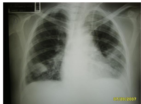
Figure 2 Image of chest radiography with areas of opacity and an image of double-lumen CVC for HD implanted in the left jugular vein.