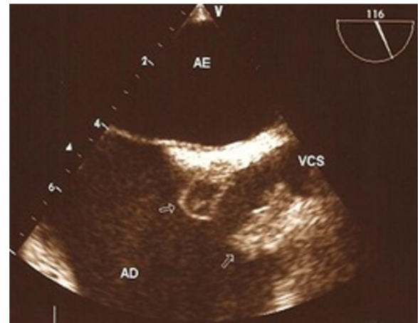
Figure 4 Echocardiography showing two images of sub-endothelial abscesses in the transition from the superior vena cava and right atrium.

of blood (with first and last sample drawn at least 1 h apart).