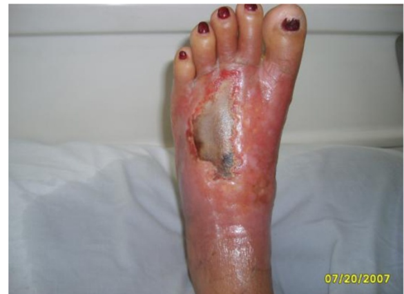
Figure 1 Hyperaemic and ulcerated lesion in the left lower limb.

The highest rates of IE are observed among patients with prosthetic valves and catheters. Other risk factors include chronic rheumatic heart disease, age-related degenerative valvular lesions, HD, and coexisting conditions such as diabetes, human immunodeficiency virus infection, and intravenous drug use. The clustering of several of these