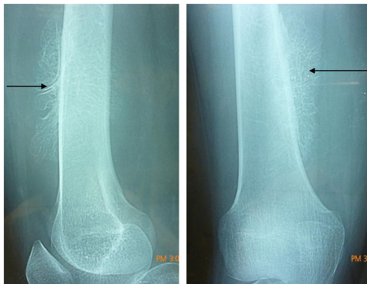
Figure 1 Antero-medial aspect of x-rays showing an ossified soft tissue mass. The arrow shows the attachment of the ossification to the femur.

Pathogenesis of ossifying lipoma is largely theoretical and considered to be a metaplastic process. Ossifying lipoma can sometimes be wrongly interpreted as myositis ossificans when there is no association with the underlying bone, therefore high index of suspicion is prerequisite in